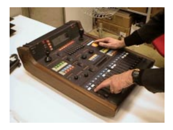
Figure 1: The PACOM console

to control the first generation of digital synthesizers [17]. In the 80's, this question was again considered at Ircam, leading to the development of the PACOM system ^{4\ 5} .