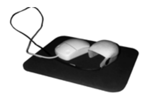
Figure 6: "Jerry" - the 4D Mouse.

A. Terrier, P. Pierrot and X. Rodet collaborated with on the development of JERRY, a four dimensional mouse - a normal computer mouse equipped with two pressure sensors, allowing the continuous control of 4 parameters [22]. Several