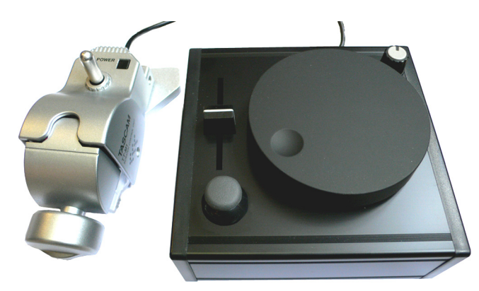
Figure 4. Tascam TT-M1 and Audile hardware interface.

There are several methods one can use to translate the gestural movements on the turntable to useful data. When a method that was portable and least intrusive was sought, the Tascam TT-M1 turntable controller (see figure 4) [14] became an ideal interface to incorporate. TT-M1 is a small device that attaches to the turntable and reads the rotation speed of the platter. Unlike the encoded records of Final Scratch or Ms. Pinky that are meant to play digital files on a computer, this device can read the platter movement while playing the sound from the vinyl record. Because this device is intended to be used with designated CD turntables, some reverse engineering was needed. The TT-M1 works like an optical mouse. An encoder disc attached to a wheel rotates at the same speed as the turntable sending pulses through an IR receiver. The firmware on the PIC chip interprets these pulses and transmits it to the host application. This data is used to change the amount of reverberation applied to the incoming sound. Another potentiometer is used to control the subtlety of this reverberation.