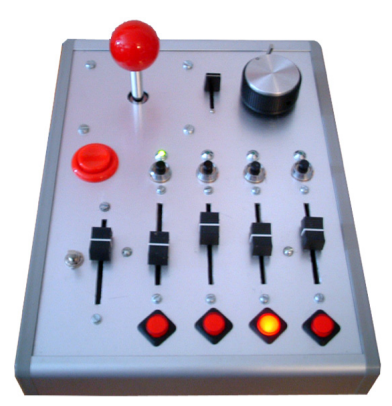
Figure 1. Lupa - hardware controller.

The hardware (see figure 1) was designed after two previous prototypes [8]. An 18F452 PIC microcontroller is used to translate numerous sensor inputs to MIDI messages. Sounds are sampled by a foot switch and later transformed by different modes of the joystick. Large game components are chosen to match the overall gestural movement of the turntable musician.