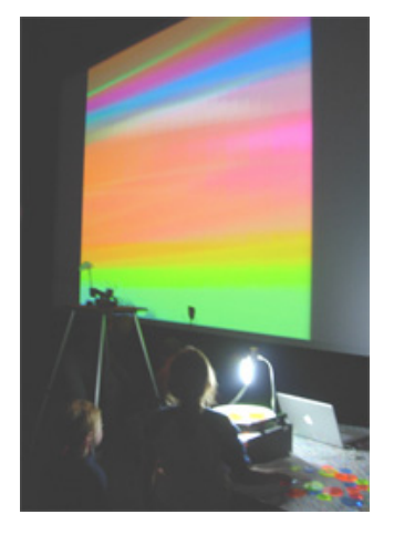
Figure 3. spinCycle sine wave generator installation

thereby combining the colors to make green, orange and violet. Each color is hard coded to sine waves at frequencies that make up a chord to insure harmonious results. The video sensing algorithm maps the area of a given color to the amplitude of the corresponding sound, thereby altering the envelope.