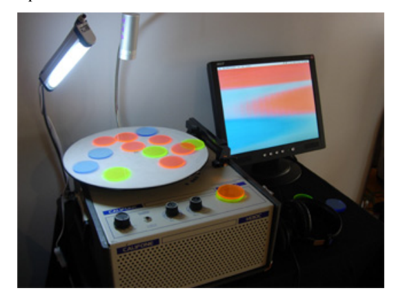
Figure 1. spinCycle, an early installation prototype

The original spinCycle consists of a turntable and video camera mounted to scan the radius of the platter and connected to a multimedia computer. Several variations of the interface have been implemented, each involving different audio content, but all consisting of the same hardware setup. Translucent plexiglass disks, with diameters of 2 or 3 inches, and tinted red, vellow or blue, are used as sound objects that can be arranged in visual patterns on the platter of the turntable. As the turntable spins, the video camera acts analogously to the needle and head cartridge of a traditional turntable, transducing sound from the colors it senses rather than from vibrations. A visual representation of what the camera sees is displayed, providing visual feedback to the audience, informing them of the correspondence between color and sound.