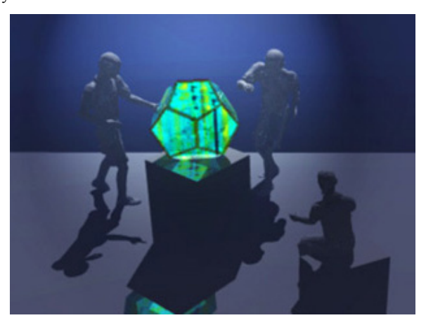
Fig4: Mock up of group interaction with Orbophone. Thin film speaker technology enables spherical sound projection together with uninterrupted image projection

The planned user interface will detect proximity of a body to each surface of the dodecahedron via an array of non-contact sensors. This allows hand gestures made above the surface of the Orbophone to influence or interfere with the projected media content. These would suit a wide range of intuitive control gestures for the audio visual content on display. Various composers and performers who work with sound spatialisation report difficulties using 3-dimensional gestures to control sound trajectories [17]. An interface using an array of proximity sensors will address that problem. A hand hovering over a particular surface could direct sound to that speaker surface. This provides intuitive direct control over the spatial position of the sound. The gesture would be further reinforced if the image display system tracked the relocated sound.