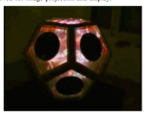
Figure 1 shows the dodecahedral structure of the Orbophone. A loudspeaker is mounted in ten of the twelve pentagonal faces.

Panning rapidly across the surfaces of a three dimensional object seems an appropriate gesture for audio spatialisation. Such a gesture may describe radiation patterns that are omnidirectional or highly directional. The icosahedron form - one of five polyhedrons defined by their congruent regular polygon surfaces and polyhedral angles - was chosen as an enclosure as it can produce a good omnidirectional radiation pattern of sound energy [15]. The dodecahedron with twelve sides is the particular variant of the icosahedron used. Though it roughly approximates a spherical surface, it is economical and capable of delivering a variety of soundfields via individually driven speakers symmetrically mounted on ten of its faces. The top and bottom faces are reserved for image projection and display.