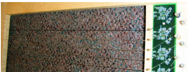
Figure 2. Harp Controller

This controller developed by Adrian Freed consists of 36 identical length nylon harp strings in a rectangular frame that is sensed with individual piezoelectric pickups. The audio signal from each string is used for trigger and timbral information so an 8kHz sample rate is used rather than standard audio sample rate.