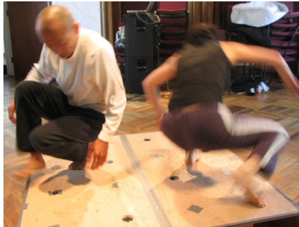
Figure 1. Dance sensor Array