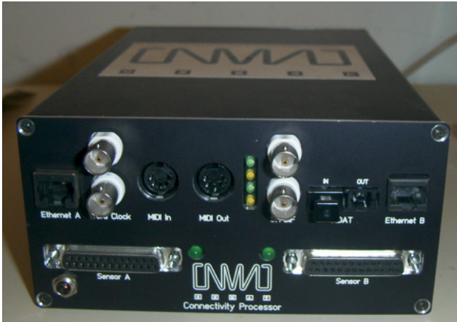
Figure 5. Gesture inputs and Digital I/O

This motherboard supports two daughter cards: one is used usually for audio input, e.g., 8-channels of balanced audio; the other is a gestural input card.