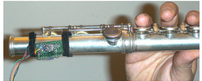
Figure 3. MEMS position sensor

This array is also used extensively on the flute by Roberto Morales [7], for example in performances of his piece “Cenzontle” which one first prize at the 2005 Bourges competition. The array uses two rotational MEMS gyros and a two-axis MEMS gyro. A low frequency filter on the accelerometer is used for tilt estimation. A high frequency is used to capture key click and other transients. Two rotation rates are estimated corresponding to pitch and yaw of the flute which are free dimensions of control for the performer.