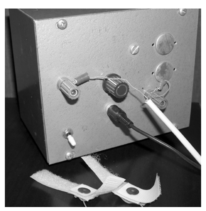
Figure 2. GSR circuit box and finger/toe sensors

While a standard methodology for the measurement of GSR data calls for the attaching of conductive sensors to the fingers of a subject (to take advantage of the greater amount of resistance fluctuation in finger tissue), as musical instruments tend to be performed using the fingers and hands, to reduce data artifacts due to physical displacement of finger mounted GSR sensors during performance, a pair of sensors were instead attached to the performer's toes. Non-performance tests of GSR fluctuations comparing toe and finger placements showed similar results for either location.