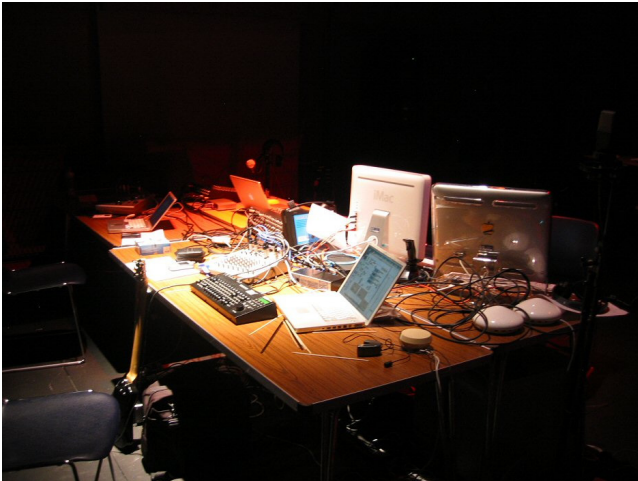
Figure 2: The BLISS Ensemble Setup