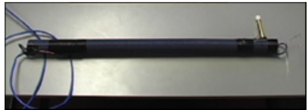
Figure 1: The G-Spring controller.

The remainder of this paper describes the design of the G-Spring, shown in Figure 1, and explains how effort is introduced by the choice of material as well as how possibilities for continuous musical evolution are investigated through the use of performer-controlled audio feedback and built-in distortion. The controller design is briefly evaluated and discussed in regards to the notion of effort. Finally, some directions for future work are outlined.